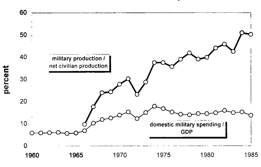
Figure 1 The Israeli War Economy

government wage payments as described in section 3), shows a dramatically different picture, however, with the ratio between overall military production and overall net civilian production rising more or less continuously from about 10% in the mid-1960s, to over 50% by the mid-1980s.<sup>4</sup> These changes were accompanied, since the early 1970s, by a severe stagilation, characterized by rapid inflation, stagnating or falling output, declines in investment and deteriorating public services. In parallel to these macroeconomic changes, there were dramatic transformations affecting the underlying structure of the business sector. Perhaps the most significant of those changes was the emergence of differential capital accumulation — that is, a combination of rising profits at the corporate core together with stagnating or falling profits in the rest of the business sector. The consequence of this differential process was the progressive consolidation of the "big economy," whereby the five largest Israeli conglomerates have increased their share of the economy's net profit from less than 3% in the