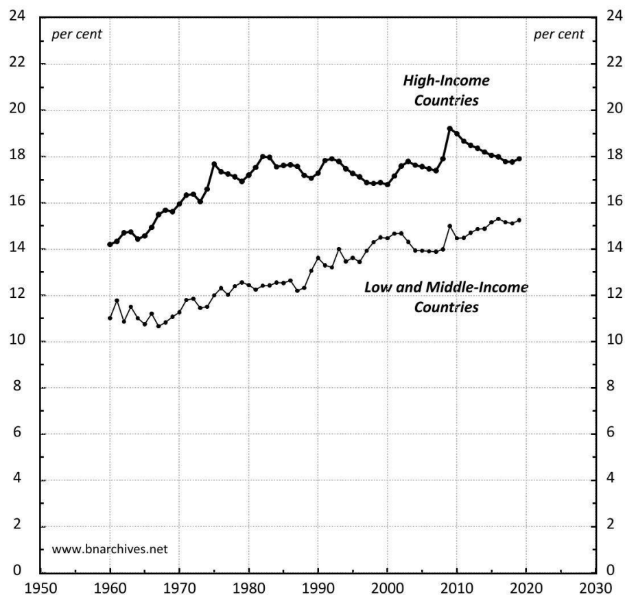
Figure 2. General Government Final Consumption Expenditure (% of GDP)

NOTE: Cutoff point between Middle- and High-Income countries: $12,696 Gross National Income per Capita in 2020 (using the World Bank Atlas Method). The last data points are for 2019.