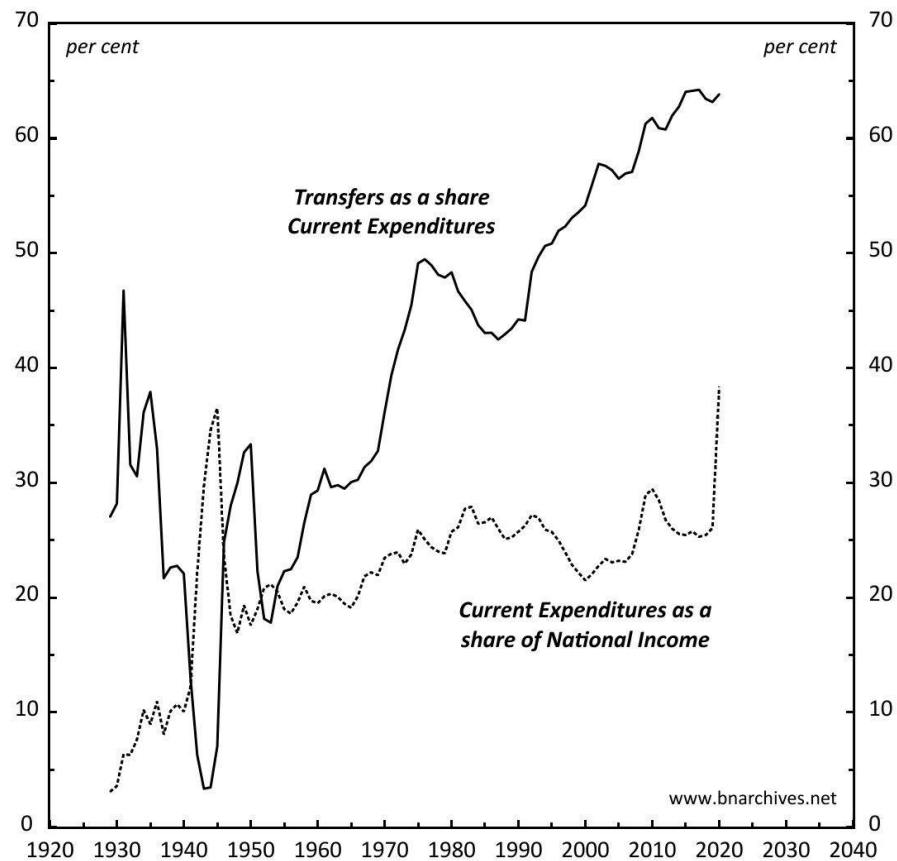
Figure 3. U.S. Federal Government: Current Expenditures and Transfers, 1929-2020

Figure 3 shows the changing importance of federal transfer payments in the United States. The dashed series depicts the level of current expenditures by the federal government, expressed as a share of U.S. national income. Note that these expenditures include purchases of goods and services, as well as transfer payments for which no goods and services are rendered in return. The solid series displays the share of transfer payments in overall current federal expenditures.